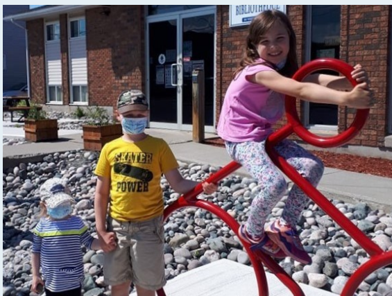
Posing in front of the new Library