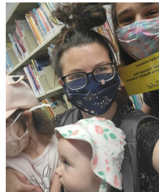
The Scavenger Hunt during the TD Summer Reading Program was a hit!