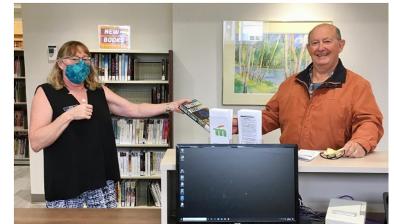
First in-person library patron visit to our new location and after being closed for six months!

Visits to the library in person or to participate in contactless pickup: 15,726