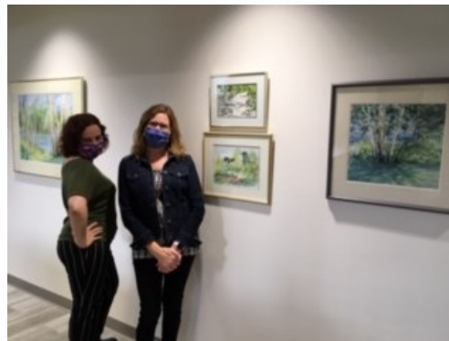
Staff members show off the library's artwork