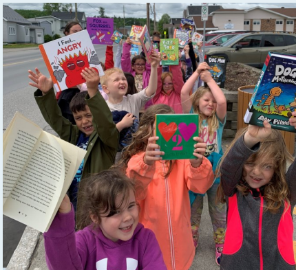
Class Visit, May 2024