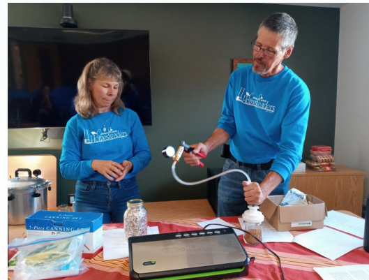
Canadian Homesteaders canning demonstration, Culture Days, October 2024