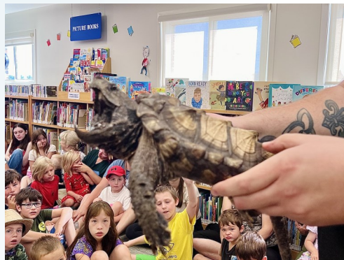
Reptile Adventure Camp, June 2024

The Temiskaming Shores Public Library is a source for inspiration and inclusion in our community. We enhance our neighbourhoods by providing access to resources, programming, and opportunities for participatory learning and leisure in both official languages.